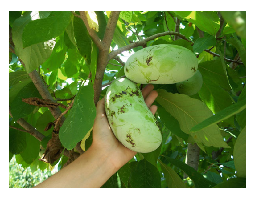
Fig. 4.2 Pawpaw fruit.