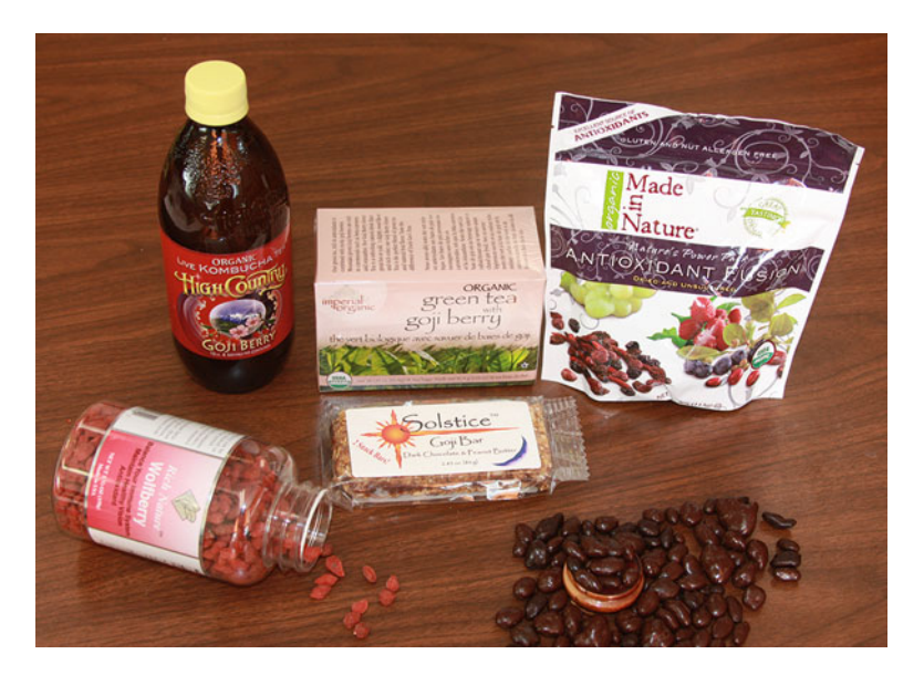
Fig. 4.11 Some gojiberries ( Lycium barbarum L.) products available for purchase in the USA. Upper left proceeding clockwise : natural carbonated juice, packaged tea, dried fruit combination, chocolate covered dried gojiberries, goji cookie bar, dried gojiberries.

Commercial plantings have increased recently due to the availability of improved cultivars and the increased demand for health products. The new plantings are composed of clonally propagated improved genotypes, not seedlings.