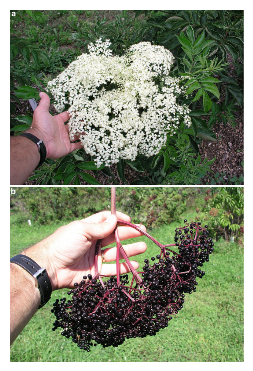
Fig. 4.9 Elderberry (a) flower and (b) fruit.

suckering. The leaves are opposite, pinnate, and 5–30 cm long, with 5–9 leaflets (usually five leaflets in S. nigra and seven leaflets in S. canadensis ) with serrated margins. The bark is gray to yellowish brown, often appearing roughened or warty. The flowers (Fig. 4.9a) are borne in dense cymes, usually terminal on the branches. Individual blossoms are white to pink, usually 3–5 mm in diameter. The fruits