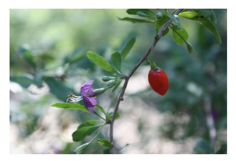
Fig. 4.10 Lycium barbarum L. flower and fruit.

fruit quality (chemical content) occurs under hot dry summer conditions, while cooler or cloudy weather diminishes fruit quality. Ripe fruit also tends to crack in rain at maturity.