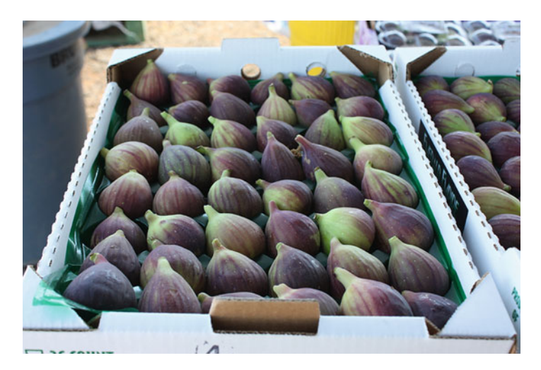
Fig. 4.7 Fruits of Brown Turkey fig.

selections from diverse areas of the world, 40 advanced selections from plant breeders (mainly from the UC Riverside breeding program), 28 caprifigs, and a small number of species and hybrids. The named cultivars in the NCGR collection represent a fair cross-section of figs from major old-world growing areas and represent the largest collection in North America. It is our policy to distribute plant material, free of charge, to research interests around the world (see our Web site http://www.ars-grin.gov/dav/). Other large international collections include the Conservatoire Botanique National Méditerranéen in Porquerolles, France and the Instituto Valenciano de Investigaciones Agrarias, in Spain. Turkey and many other countries have invaluable collections of local cultivars.