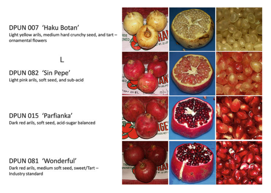
Fig. 4.5 Pomegranate 'Wonderful' fruit.

The juicy arils are the edible portion of the fruit, are attached to the mesocarp, and are derived from epidermal cells. In different cultivars, arils range from deep red to virtually colorless, seed softness varies greatly based on content of schlerenchyma tissue, and acidity varies from 0.2 to 3% of the expressed juice. At maturity, soluble solids are quite high (15–20%) and differing levels of acid result in fruits which range from sweet to sweet/tart to very tart indeed.