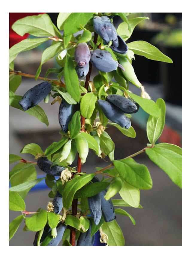
Fig. 4.8 Russian blue honesuckle Lonicera caerulea 'Morena.'

production, it is essential that cultivars be suitable for mechanical harvesting. Although it appears feasible, this aspect has not been tested, as yet, but is under consideration for future research.