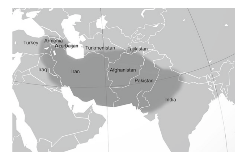
Fig. 4.6 Center of origin for Pomegranate ( Punica granatum L.). Prepared by Ed Stover, USDA ARS

prehistoric times and interpretation of the original native range varies among authors, but Iran and the surrounding area (Mars 2000) are widely accepted (Fig. 4.6), while others extend the region of origin more broadly (Morton 1987). In general, wild pomegranate fruits have thicker rinds, extremely high acidity, and smaller arils compared to cultivated types (Bist et al. 1994; Kher 1999). Human use of pomegranate has a long history, with cultivation projected as early as 3000 BCE (Stover and Mercure 2007). Pomegranates are important in the symbolism and literature of many middle-eastern cultures. It is one of the symbols of the love goddess Aphrodite (Encyclopedia Britannica 2006), is central to the Greek myth of Persephone, and is mentioned three times in the Qur'an and 23 times in the Hebrew Bible (Janick 2007).