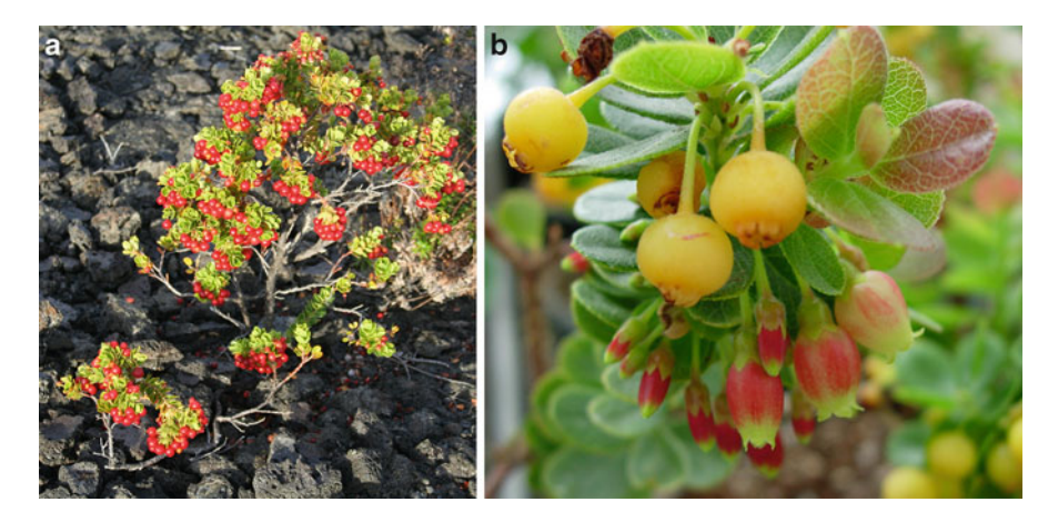
Fig. 4.12 ( a , b ) 'Ōhelo ( Vaccinium reticulatum Sm.) ( a ) with red fruit growing out of lava rock on the Big Island, Hawaii ( b ) yellow fruited form.

The berries range from 0.6 to almost 1.2 cm (1/4 to almost 1/2 in.) in diameter and contain numerous (70 to over 100) small, brown seeds. The flowers of V. reticulatum are self fertile. However, self pollination results in fewer seeds per berry than does cross-pollination (Herring 2008).