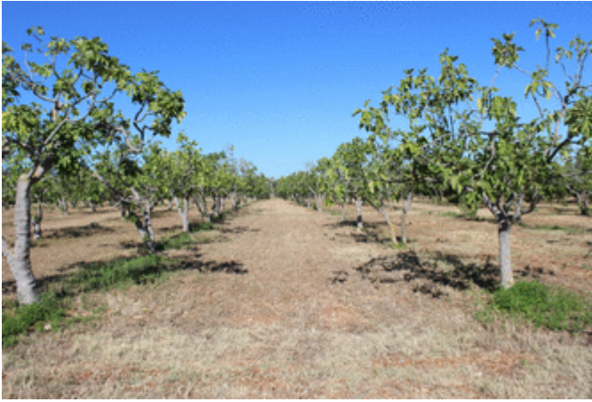
Fig. 2. Fig repository at the P. Martucci experimental station in Valenzano (Bari, Italy) in summer time.

evaluate the presence, number and development of brebas. In the third week of May, fruit-set of brebas was evaluated. For the main crop production, the fruit-set was calculated on six tagged shoots per tree that were left to open pollination.