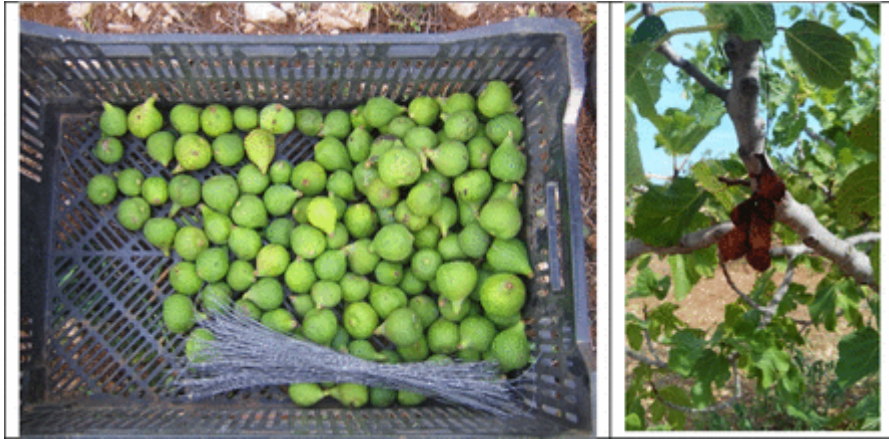
Fig. 1. Profichi to be prepared for the caprification trials (left) and at the end of caprification (right).