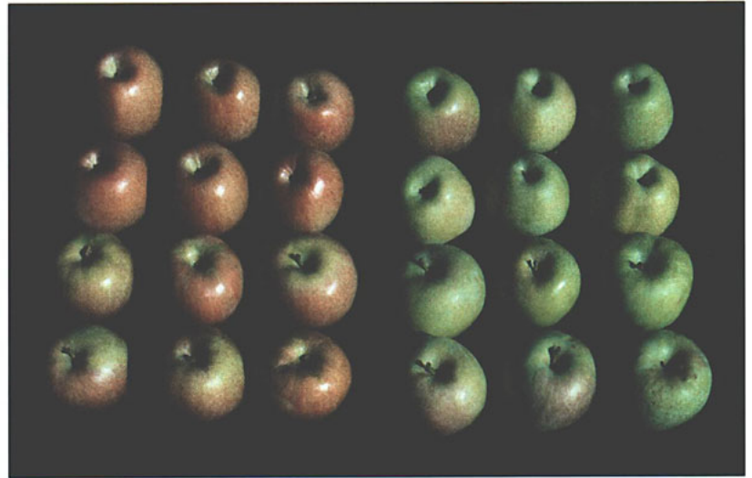
▲ Apples grown with reflective material (left) developed more red skin color than apples grown without (right).